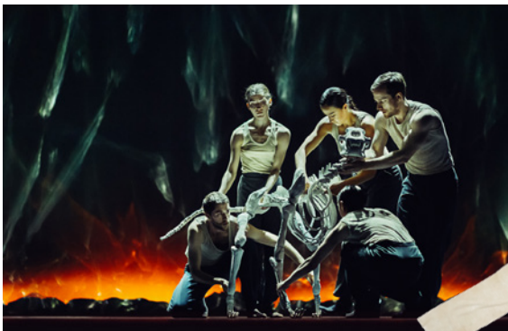
Figures in Extinction [1.0]

Figures in Extinction [1.0] is the first part of a major new collaboration between Director Simon McBurney and Choreographer Crystal Pite, who will work together over four years to create three new works, each developed in response to the last. This episode confronts what it means for artists to make work in an era of mass extinction, responding to the question of how to bear witness to what we are losing.