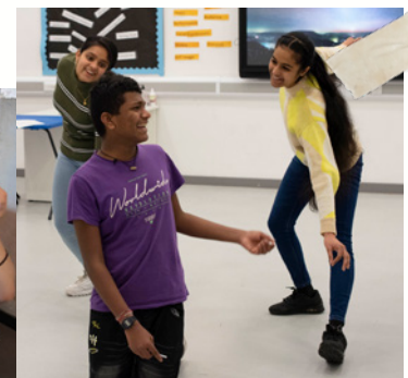
clockwise (from top): Everything that Rises Must Dance, Schools, Grief Chorus