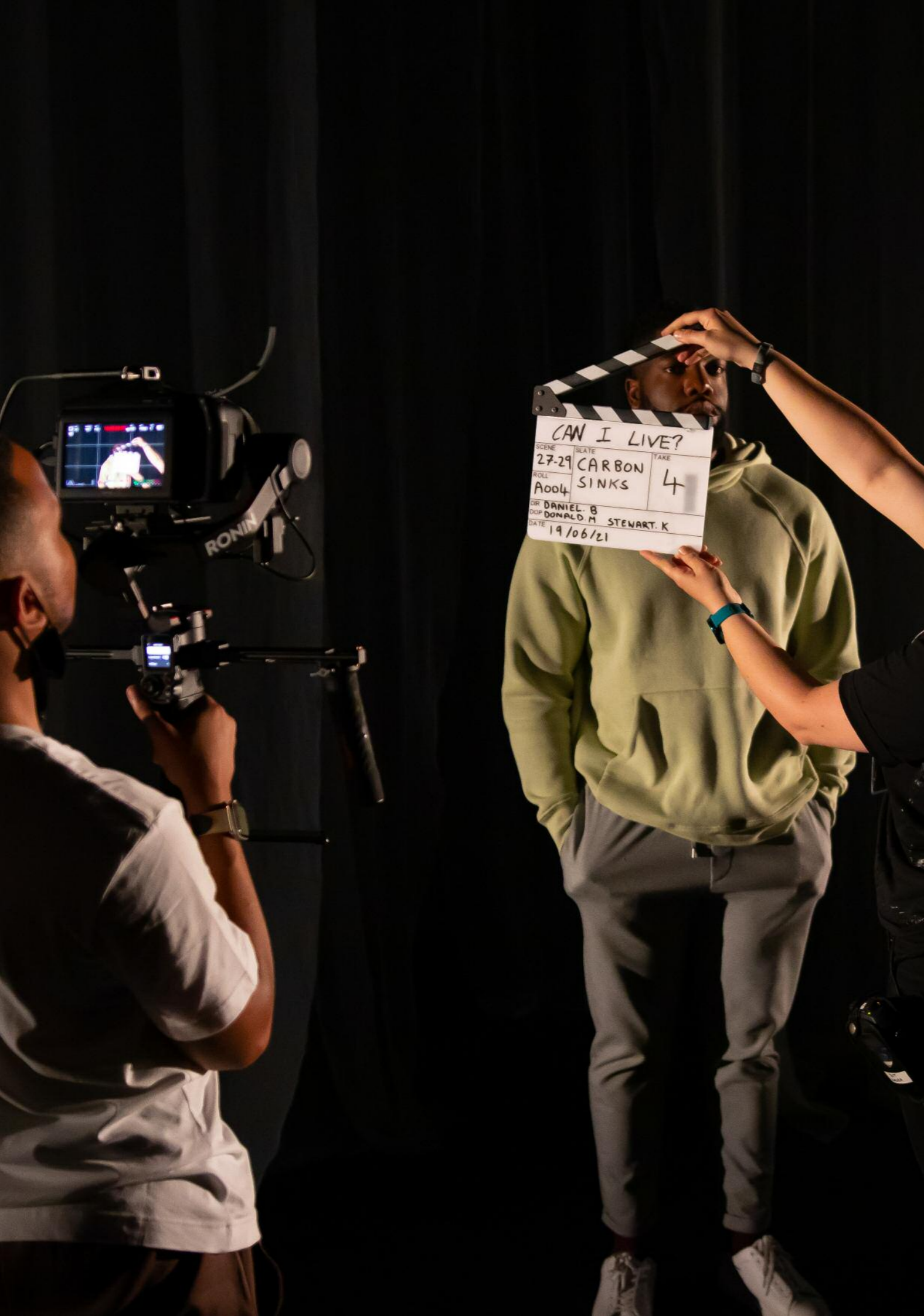
photo credits - (opposite) Donald Matheson, Fehinti Balogun. photo © David Hewitt

The next steps for us will be to measure the footprint of the digital tour. Awareness of the carbon footprint of digital activity is growing - just because something is not material does not mean that it has no footprint. Our aim is to contribute to the understanding of the carbon footprint of digital activity through this exercise.